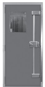
STANLEY Seclusion Room Lock (SSRL)