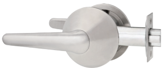
STANLEY Patient Safety Lever (SPSL) - Cylindrical