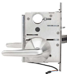
STANLEY Patient Safety Electrified (SPSE)