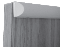
STANLEY Emergency Door Alarm (SEDA)